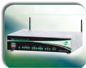
Digi TransPort™ Family