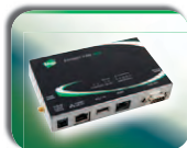
Digi Connect® WAN Family