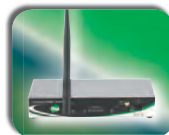
ConnectPort™ WAN Family