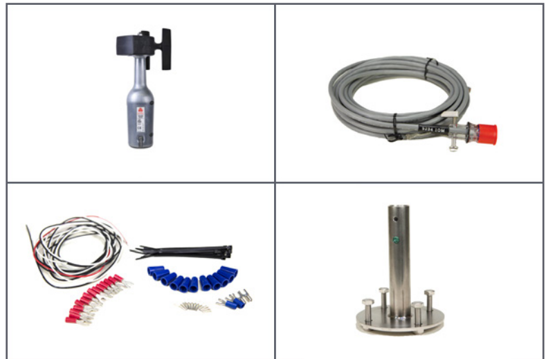
Hybrid XT Vane Retrofit Kit | Mitsubishi | NEI (#9371)

not just sensors, so we have created complete retrofit kits so you can easily transition from your previous sensor to the Hybrid XT sensor. Each retrofit kit includes a sensor, the cable needed for your application, and a mechanical mounting solution to fit the sensor to your turbine.